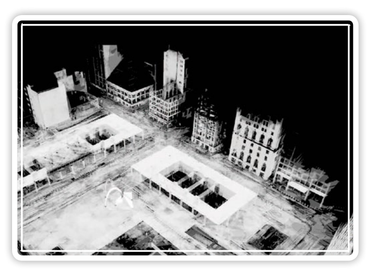
EdgeWise Building automatically extracted polygons from 500 scans of the Chicago Federal Center.

Due to the project's compressed schedule, Ghafari's modeling team began creating the Revit model in parallel with the scanning effort using existing 2D drawings of the plaza and sub-levels. Despite inaccuracies in these older 2D drawings from the 1960's, they still provided a starting point that could be updated by the scan data.