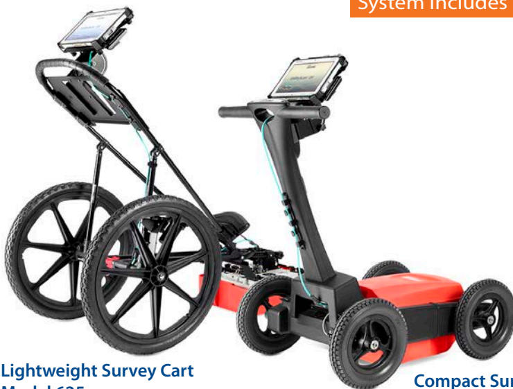
Lightweight Survey Cart Model 625