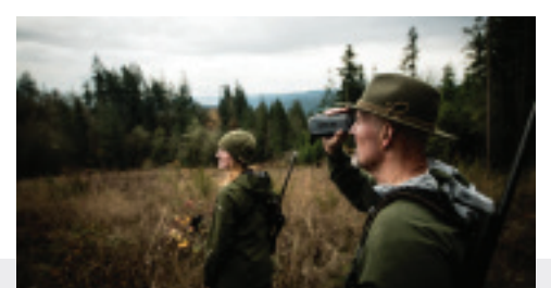
REDESIGNED USER INTERFACE The Scion OTM's polished user interface packs functionality into a rugged handheld optic

The Scion OTM is ready to capture any wildlife encounter with onboard video and image recording. Smooth 60 Hz thermal imaging preserves details on moving objects while internal storage and a built-in microSD<sup>™</sup> card slot provide enough memory for the most demanding trips. Additional Bluetooth<sup>®</sup> and Wi-Fi capabilities allow simple file transfer between devices.