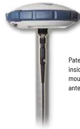
Patented inside-the-rod mounted UHF antenna design