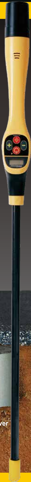
Cast Iron/Steel Pipe