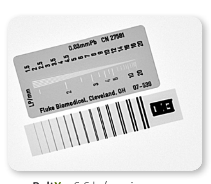
BoltX – 6.6 lp/mm image