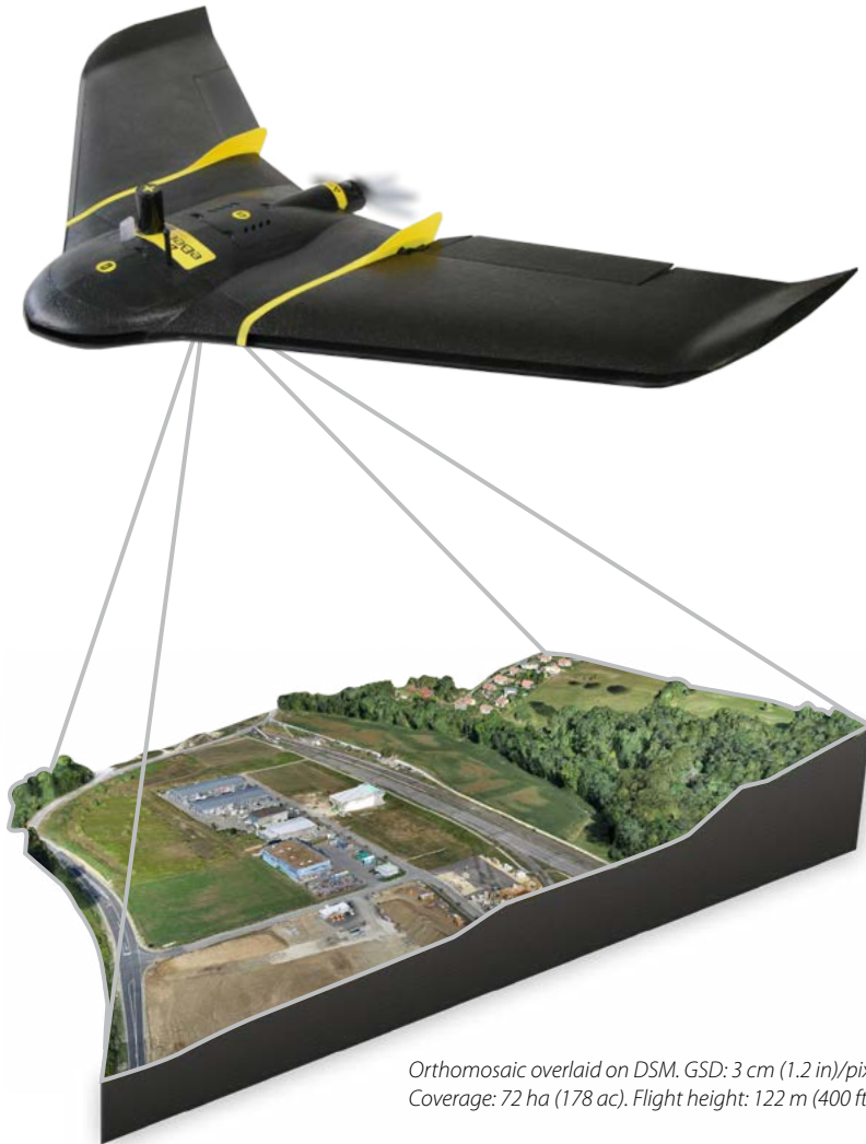
Orthomosaic overlaid on DSM. GSD: 3 cm (1.2 in)/pixel. Coverage: 72 ha (178 ac). Flight height: 122 m (400 ft) AGL.