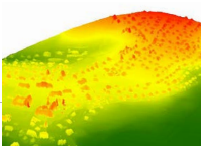
Digital Surface Models (DSMs)

The DSM is an essential component of the orthomosaicing process. It displays a continuous surface, featuring the tops of objects and structures such as trees and buildings (inc. bare earth when nothing is obscuring it). Ground-based objects can also be removed to produce a digital terrain model (DTM).