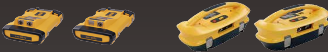
Loc-5DTx and Loc-5STx (5 Watt Transmitters)