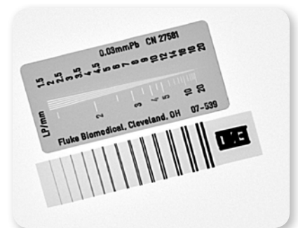
BoltX – 6.6 lp/mm image

*Manufacturer's technical specifications may change without prior notice.