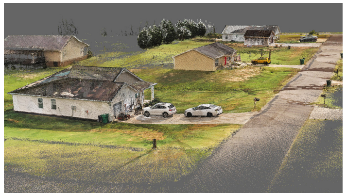
Figure 2 - Scan of rural street with houses