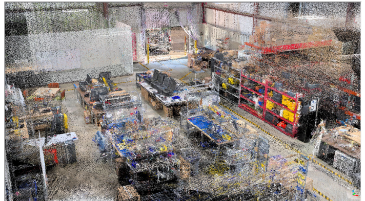
Figure 1 - Scan of the manufacturing area of GeoCue's Huntsville office