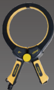
50mm, 100mm, 125mm sizes Transmitter clamps