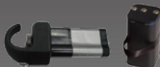
Receiver/Transmitter rechargeable battery packs