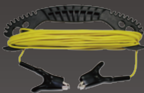
Extension ground cable